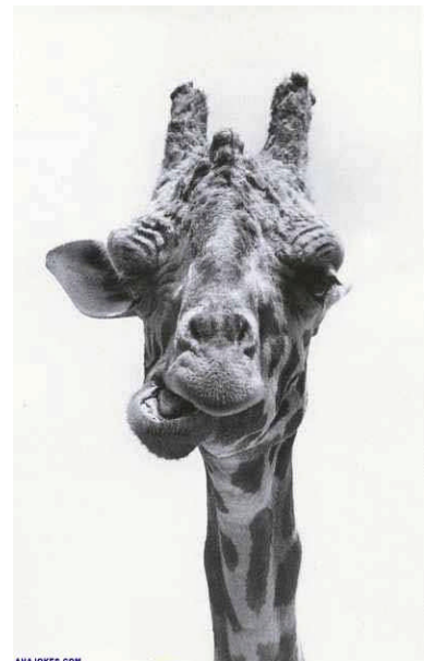
The giraffe told me to do it.

Are you a teacher? Do you want the full learning package, including weekly newsletters, curriculum, school visits (conditions apply) and a bit more? There are only 40 class packages ($200) available so sign up now. See the Teacher's Guide for more.